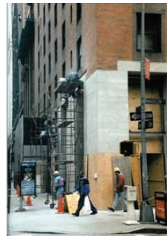
Clockwise from top: Completed exterior restoration of the Roger Williams Hotel. The finely honed, limestone interior walls of the grand lobby. Urban D.C.'s in-house crew, installing the structural steel that supports the window openings.